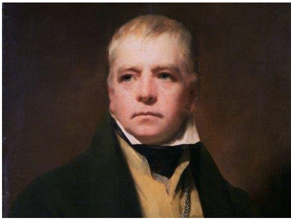
Figure 1: Portrait of Sir Walter Scott 1822, National Portrait Gallery, London, UK.