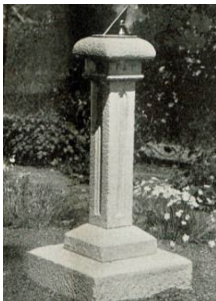
Figure 3: The replica sundial at Hillside, Menands, NY, c. 1902

was made for Hillside, Menands, NY, as shown in Figure 3. below. In 'Sun-Dials and Roses of Yesterday' by Alice Morse Earl, (1902 edition of the book 3 ), pages 12-13 show the replica sundial to be in existence at Hillside, NY, in the Shakespeare Garden border--See Figure 3 below.