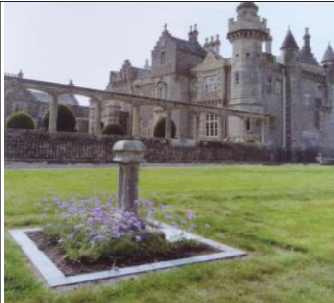
Figure 2: The pedestal of Scott's sundial at Abbotsford, Cowan 2019.

was made for Hillside, Menands, NY, as shown in Figure 3. below. In 'Sun-Dials and Roses of Yesterday' by Alice Morse Earl, (1902 edition of the book 3 ), pages 12-13 show the replica sundial to be in existence at Hillside, NY, in the Shakespeare Garden border--See Figure 3 below.